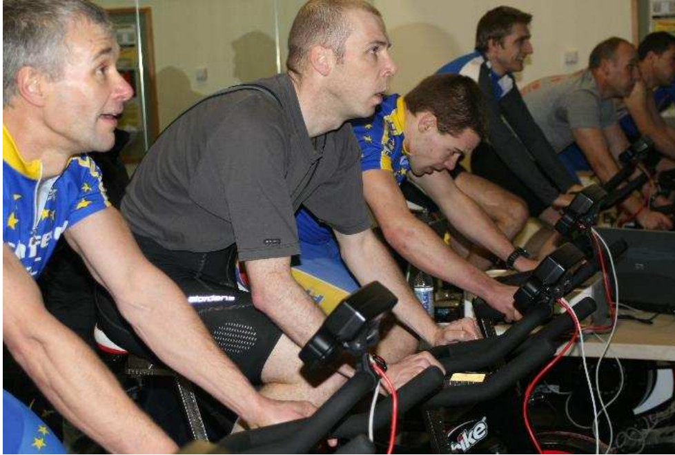
Lichfield City Cycling Club using the school facilities during weekly race nights