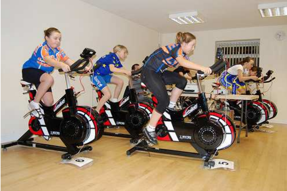
Wattbike Racing at the Friary School, Lichfield